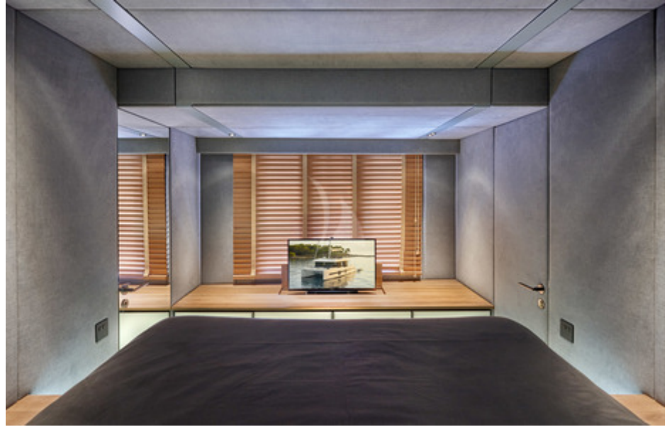
VIP cabin 2