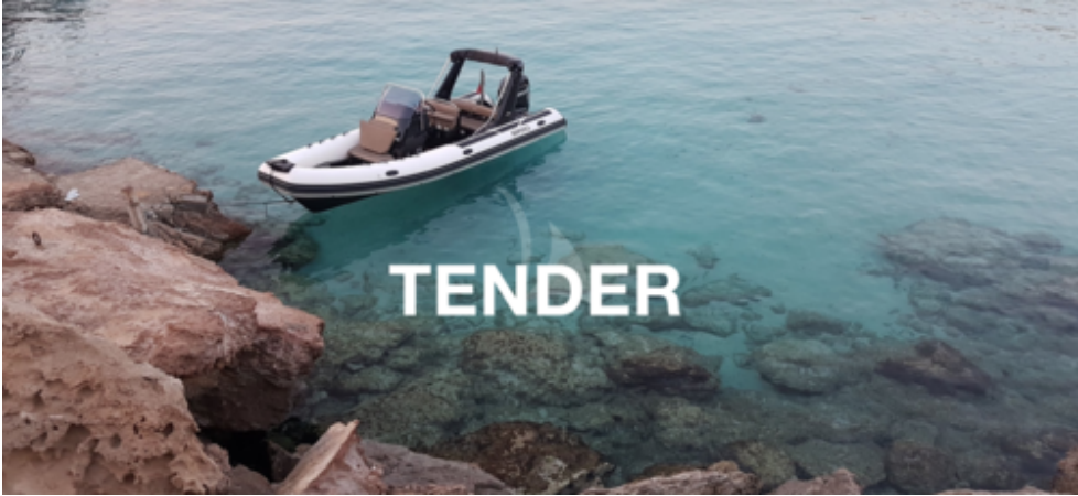
Tender (summer only)