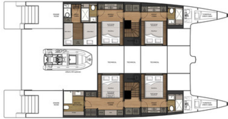
Layout (lower deck)