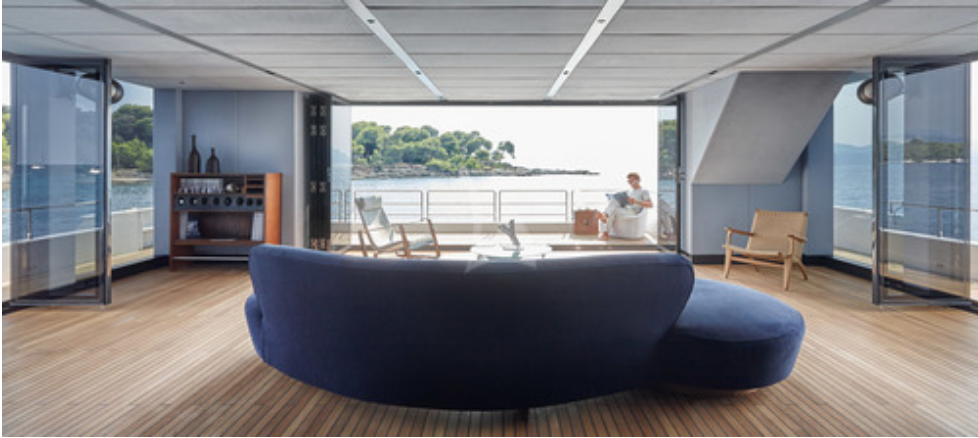
Salon (layout one)