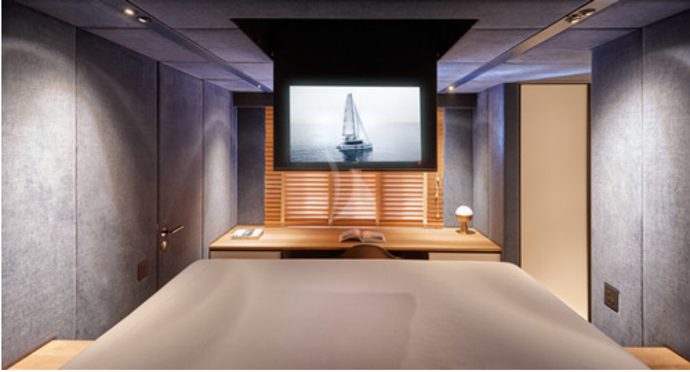
VIP cabin 1