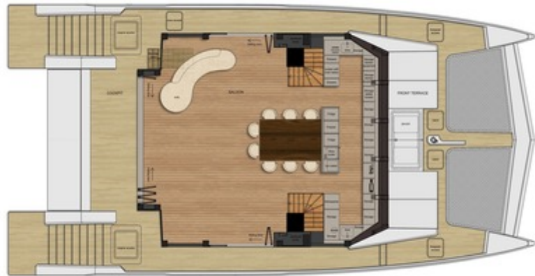
Layout (main deck)