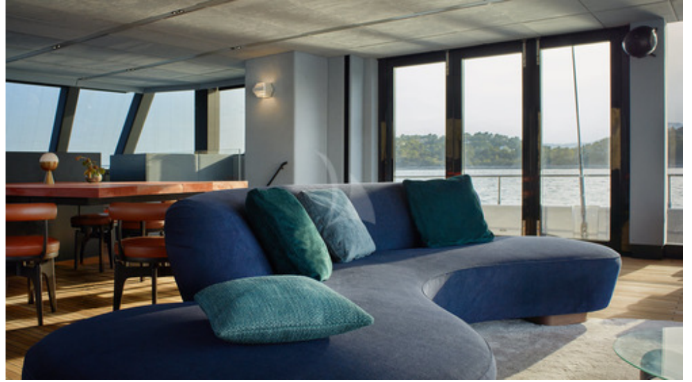
Salon couch (layout one)