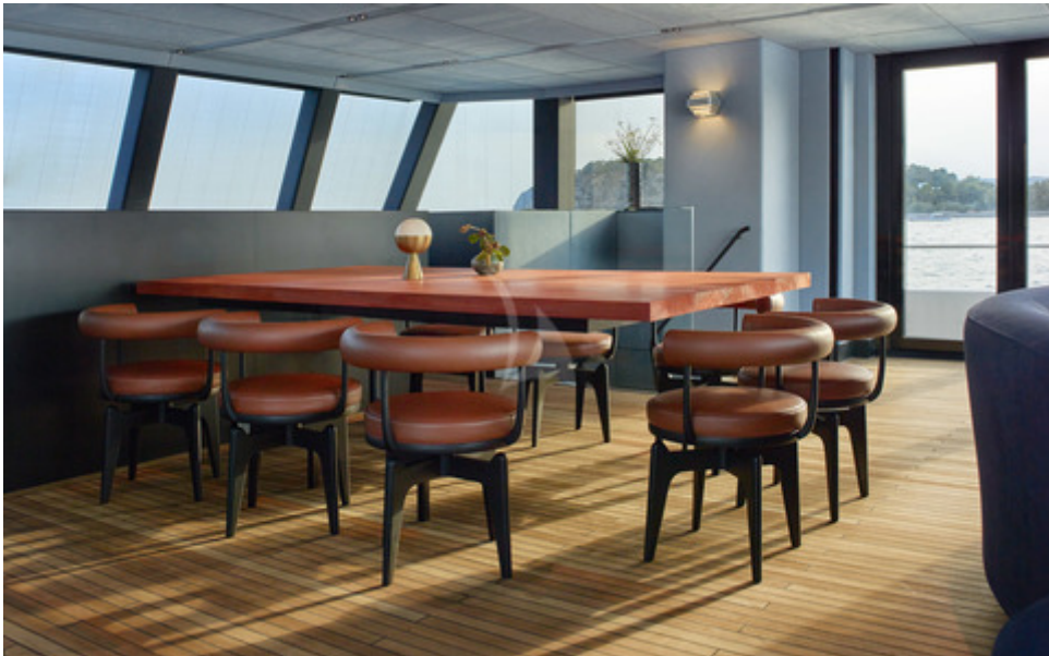
Dining (layout one)